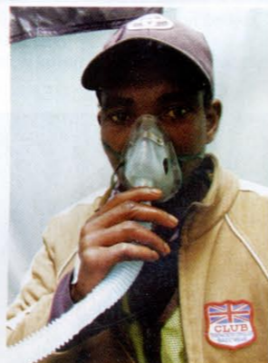
A Big Issue vendor is tested for TB.